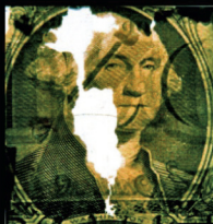
Dollar Image, 1989

George Washington's face dissolves revealing continents