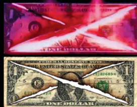
Take a sniff, it smells good!

"... It is possible that the aesthetic approach may provide short cuts to the evaluation and criticism of plans for action." ASU p. 257