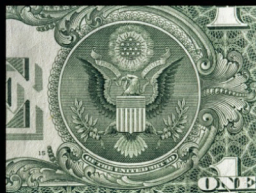
G.M.O. Genetically Modified Dollar, 2005©